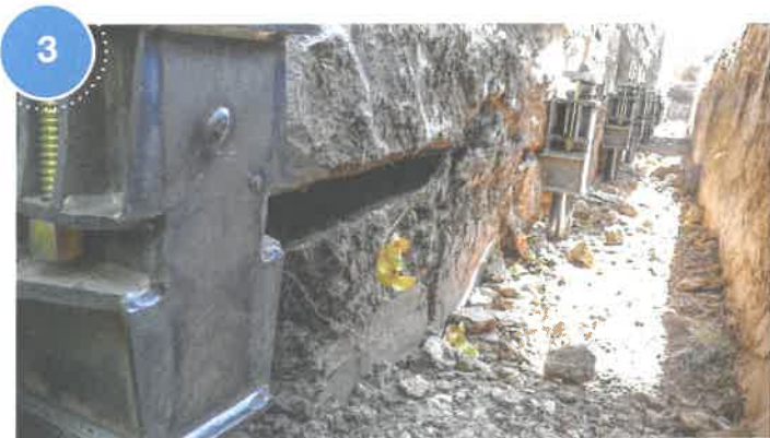
Transfer weight of the home, through piers, to competent, deep soils.