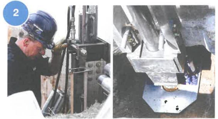
Secure bracket to the footing and drive piers into the soil.