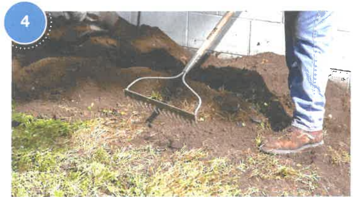
Replace soil and clean up the installation area.