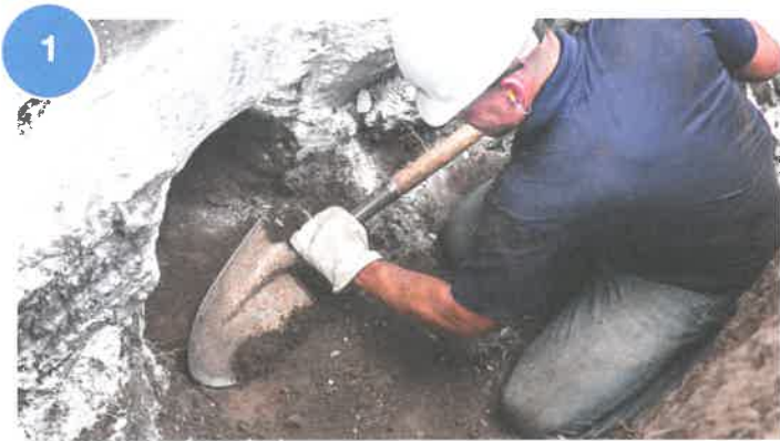
Expose footing and prepare for bracket.