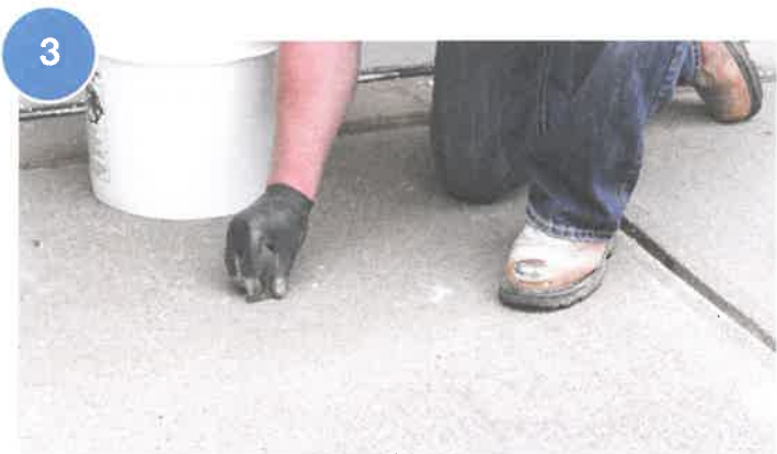
Patched holes become virtually invisible.