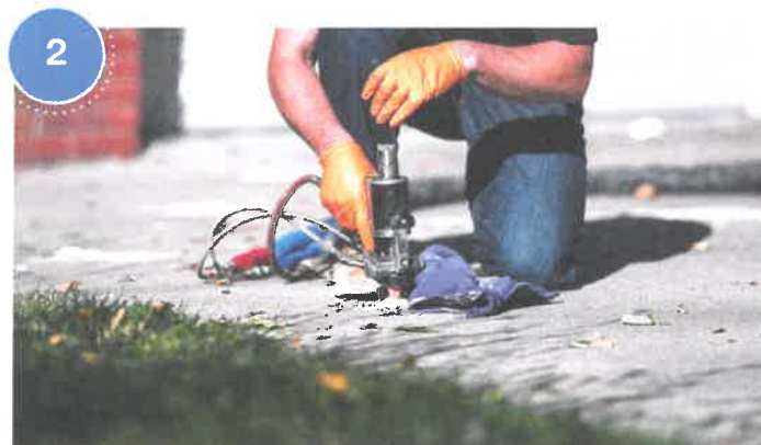
Inject PolyLevel foam beneath slab to fill voids and lift.