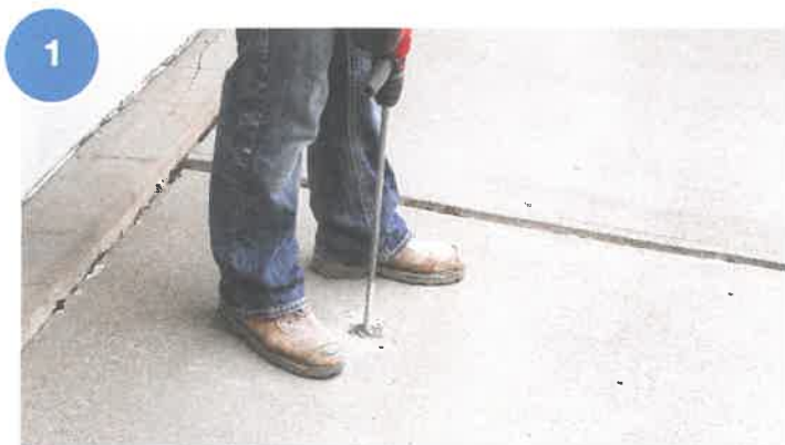
Strategically drill pea-sized holes through the slab.